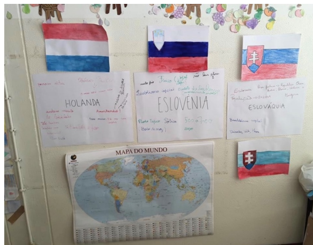
Figure 5: Mind maps created by the students about each country

During the first day, pupils developed some motivating activities by: a) creating a mind map for each country based on what they already knew about each one (Figure 5); b) locating the country on a map; c) participating in a WebQuest to explore each country to learn a little bit more about each one ( https://klaritaml.wixsite.com/ep-te-project ); d) creating the flag of the country in a creative way.