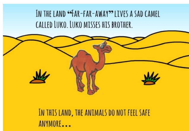
Figure 4: Page from the Picture Book

Following a project work methodology, the pupils were able to create a picture book about the refugee crisis, which was created collaboratively. The picture book (Figure 4) can be downloaded at https://pt.calameo.com/read/004301042a8bd0afc31c8 and its plot is the following: