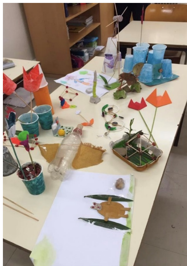
Figure 7: Typical symbols from each country created by the pupils