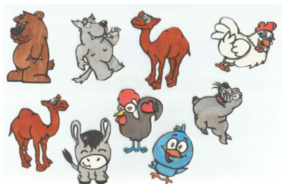
Figure 9: Stickers with animals from the different countries' biodiversity

Afterwards, pupils were able to participate in a storytelling activity, by focusing on Luko's story and this refugee's journey. Through the picture book, which pupils helped to create, they learned about the topic and what was at stake when one abandons his/her country to find his/her brother. In reality, pupils learned that while travelling around the different countries, Luko came in contact with the citizens, the different languages and cultural symbols. At the same time, while participating in the storytelling process, pupils had the chance to work with stickers which represented the animals which could be found in the countries (Figure 9). These animals are the animals which Luko gets to know throughout the story.