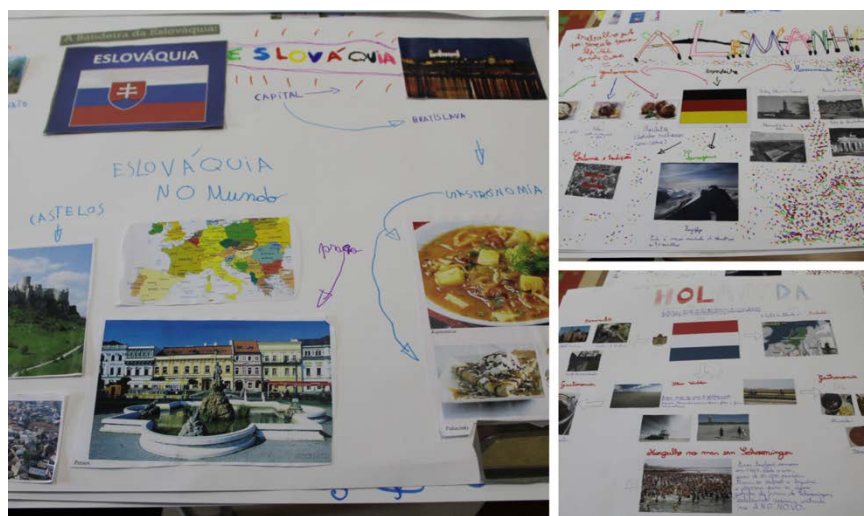
Figure 8: Posters developed collaboratively

On Day 3, pupils learned the numbers, greetings and a song in the languages of the different countries. During the last day, children had the chance to participate in a sum-up activity. In fact, after having finished the poster (Figure 8) for their presentation with the information they had collected and learned over the previous days, they then presented each country. In the end, they completed an evaluation worksheet about their learning throughout all the activities and their teachers' performance.