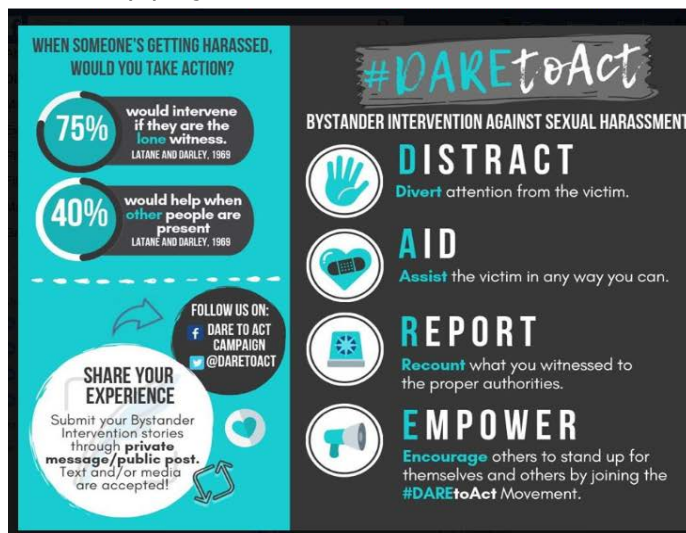
Figure 2. Sample infographic