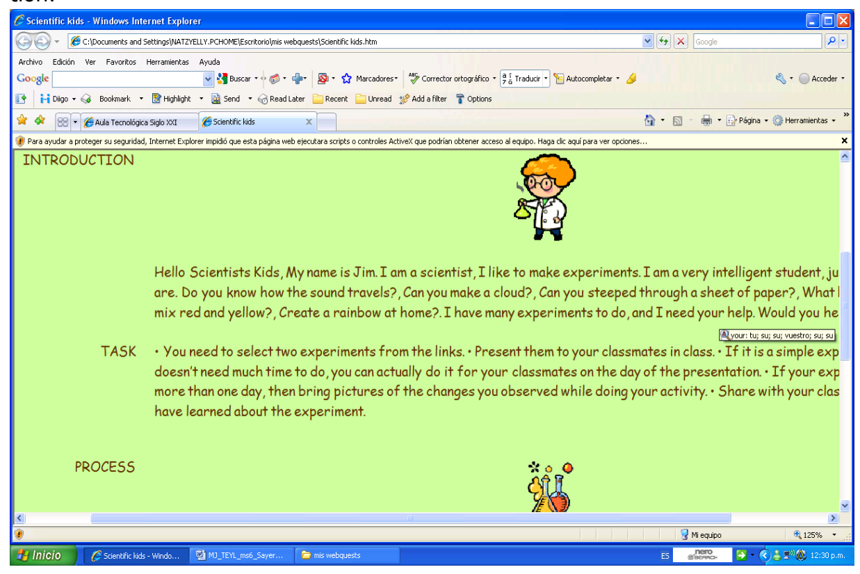
Figure 1. The Introductory Part of my WebQuest.

Here is my WebQuest on science. In figure 1, you will see the introductory part of my WebQuest. In figures 2 and 3, you will see a couple of the websites visited by my students. The sites that children visited are listed in the Resources Section.