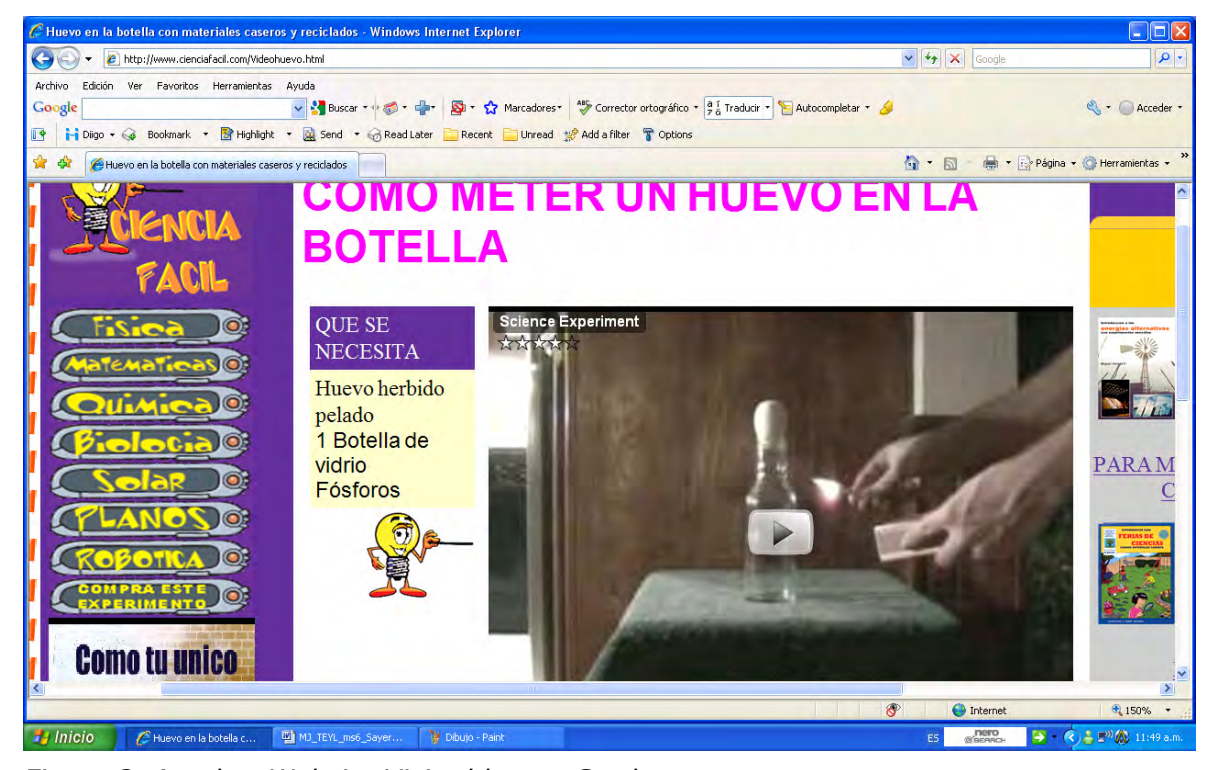
Figure 3. Another Website Visited by my Students.